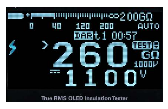
Figure 5. Adjustable insulation test voltage up to 1.1 kV

The adjustable insulation test voltage from 10 V to 1.1 kV in 1 V steps on selected two models¹ allows you to set precise test voltages catered to unique test application requirements. These typical applications are commercial avionics testing, military communications system testing and production line testing. The standard test voltages from 50 V to 1 kV is also available for selected models².