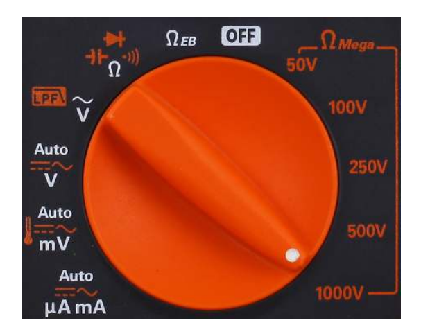
Figure 6. Insulation resistance tester with full featured DMM