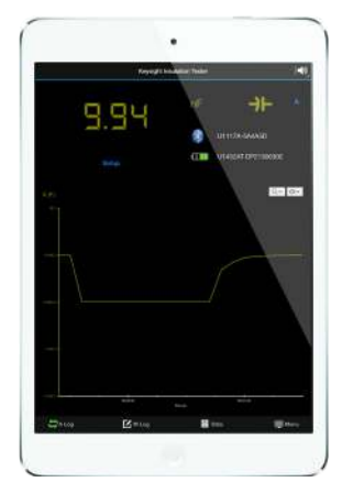
Figure 3. Data logging interface on Keysight Insulation Tester Application