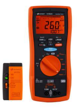
Figure 4. U1117A IR-to-Bluetooth Adapter enables wireless remote testings with the U1450A/U1460A series