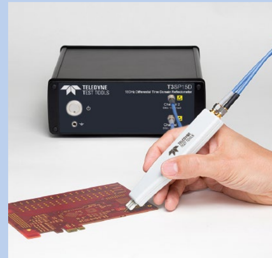
Based on the true differential design, there is no need for a physical ground connection if differential lanes are measured