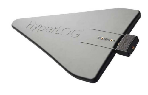
The BPSG as field-strength-generator up to 3V/m (1m distance), available as "DFG 4060"

With a maximum output of + 18dBm and a Dynamic range of up to 65dB the BPSG sets new standards for battery-powered signal generators. Thanks to the internal TCXO time base the BPSG generates stable and accurate RF frequencies up to 6GHz. The BPSG can also be connected to an external reference clock and thus be synchronized with a measuring system. In addition, this way even higher accuracy can be achieved (using an OCXO, rubidium timebase etc.).