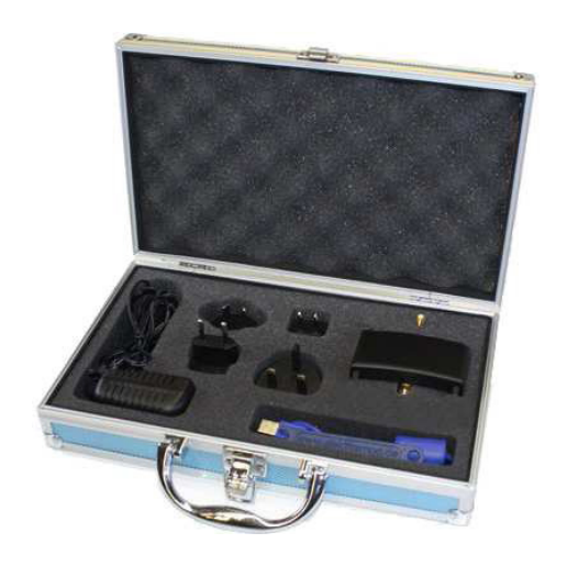
Scope of delivery: transport case, international 12V power supply, USB cable, SMA/SMA (f/f) adapter, SMA tool, PC software, calibration data

Many Aaronia antennas can be transformed into an active field strength generator in combination with the BPSG in a few simple steps. In standalone mode, the generator can produce simple or very complex batch programs that automatically start after power up. This allows to create a fixed frequency and level or the start of a predefined sweep, complex frequency lists, modulation, etc.